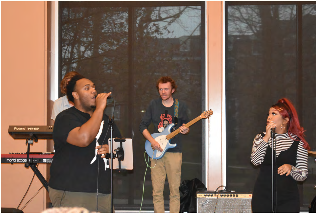
Special Guests: Trumusiq Group