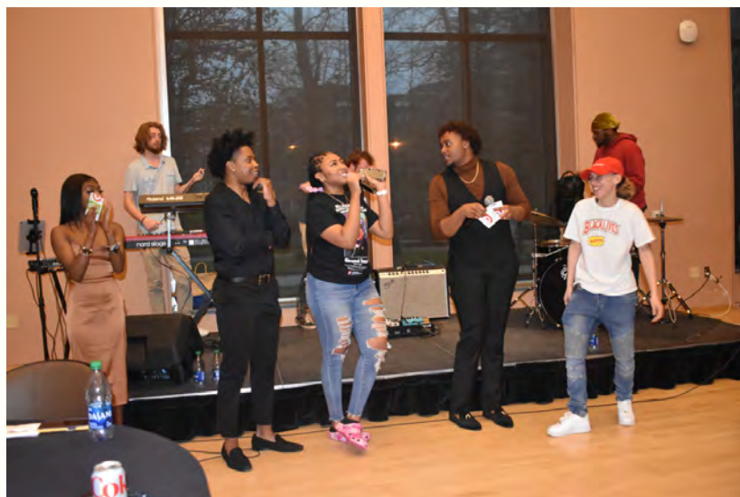
Celebrating the showcase winners!